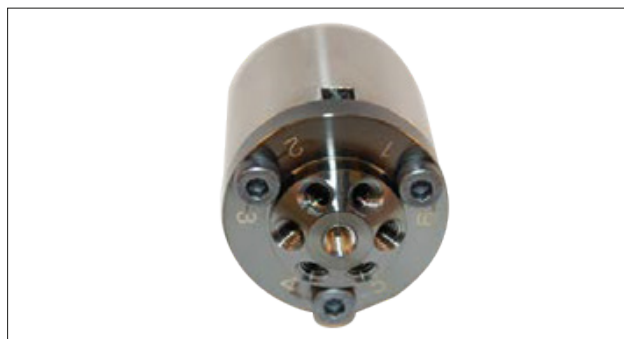
Figure 1. Intermediate Loop Decompression (ILD) injection valve.

loop, part of the sample has been diluted owing to the change from high pressure to ambient pressure as the valve switches. Introducing a sample volume into the UHPLC system that has been partially diluted results in peaks that represent an inaccurate analyte concentration.