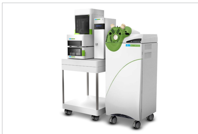
Figure 4. The QSight LX50 UHPLC integrates with all QSight MS/MS models.

The PerkinElmer QSight LX50 UHPLC integrates seamlessly with both the QSight LC/MS/MS and its Simplicity™ 3Q software to deliver the highest levels of performance from sample handling right through final results and reporting. The QSight LX50 UHPLC delivers the perfect blend of performance and reliability you need to optimize your workflow and achieve higher levels of productivity.