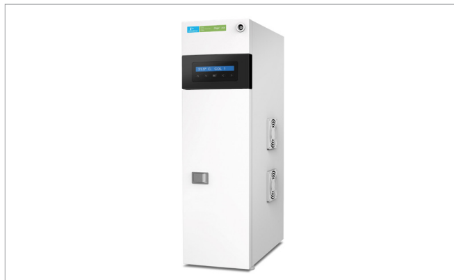
Figure 3. QSight LX50 Column Stability Module.

An often overlooked and underappreciated component of an UHPLC system is its column temperature control module (frequently referred to as a column oven). Maintaining a precise and consistent temperature for both the column and mobile phases results in highly reproducible retention times, while having the ability to set a specific temperature is a great tool to enhance selectivity, improve peak shape and reduce analysis time. Finally, the ability to run at elevated temperatures reduces column back pressure significantly – which allows higher solvent flow rates even with narrower columns and smaller particles. The QSight LX50 Column Stability Module delivers precise and consistent temperature control while offering a spacious multi-column compartment for quick and easy access. Also, the QSight LX50 incorporates a solvent pre-heater mechanism that effectively regulates solvent temperature before it reaches the column to ensure maximum stability and reproducibility from run to run.